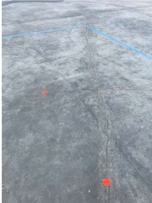
Concrete chips to grind / fill.