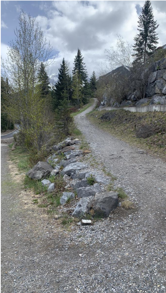
Figure 9: Connection Prospect Heights to Emergency Access Ln.