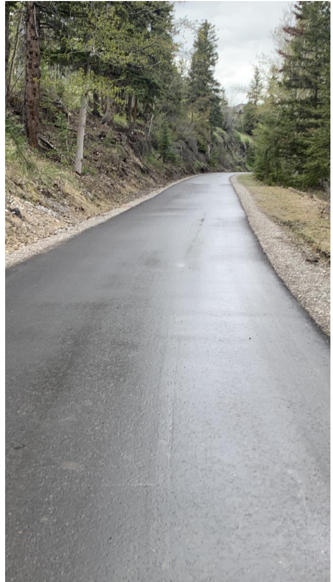
Figure 4: Prospect Ln.