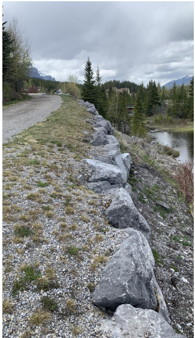
Figure 12: Existing boulder retaining wall.