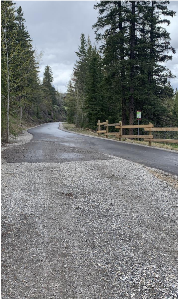
Figure 3: Prospect Ln.