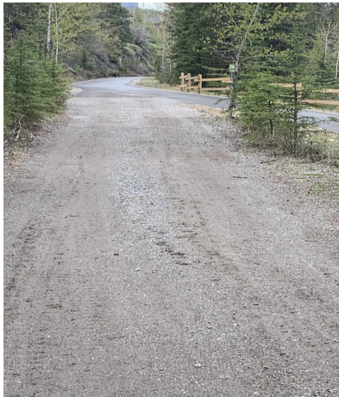
Figure 2: Prospect Ln.