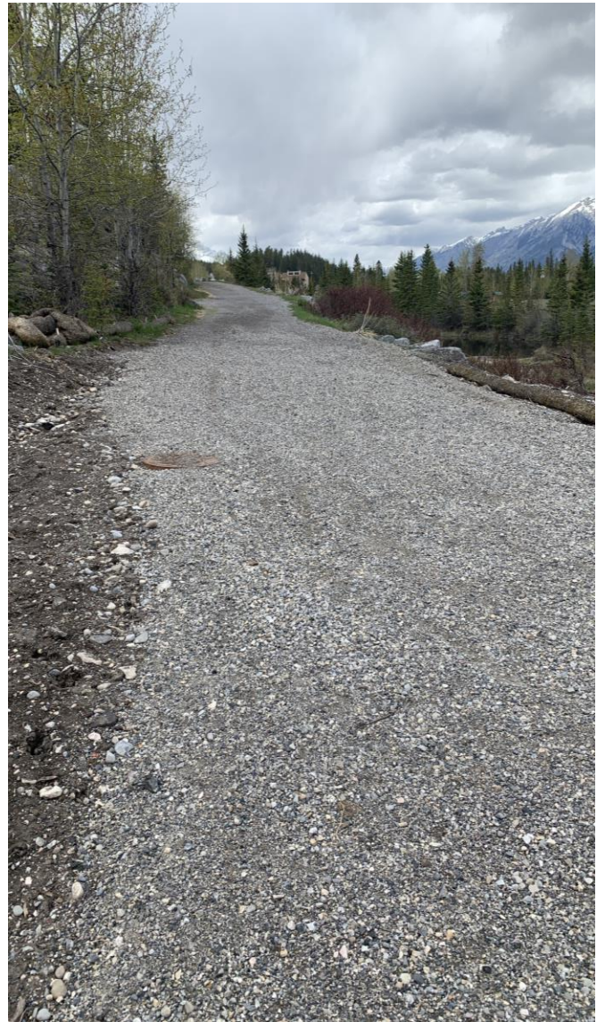
Figure 8: Emergency Access Ln.