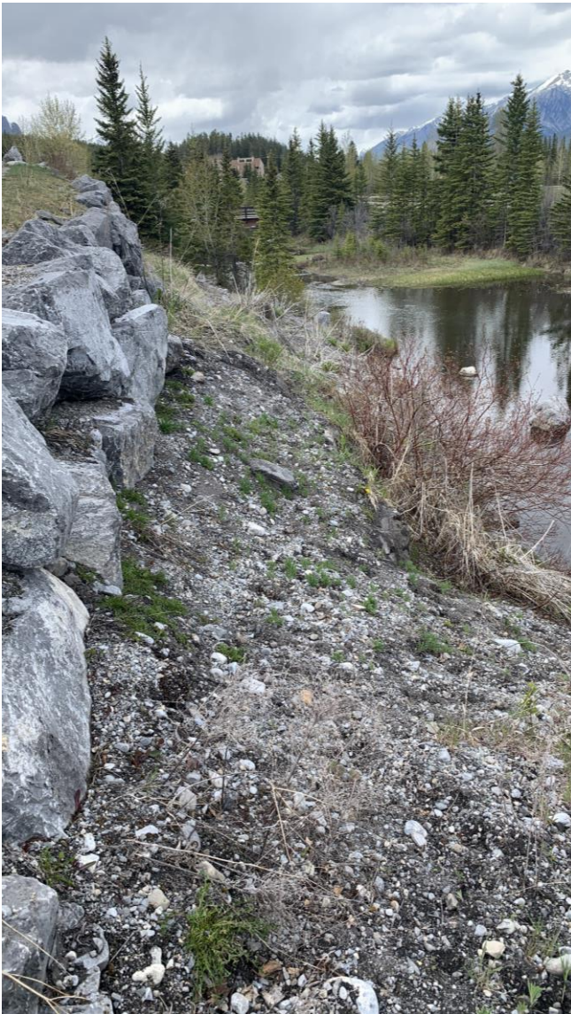
Figure 11: Existing boulder retaining wall.