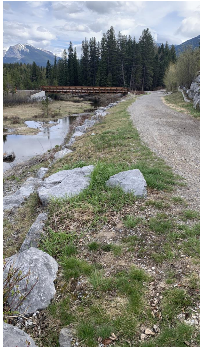
Figure 10: Existing boulder retaining wall.