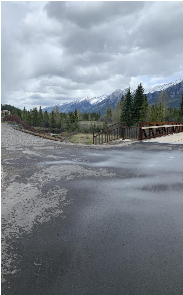
Figure 7: Emergency Access Ln. (left)