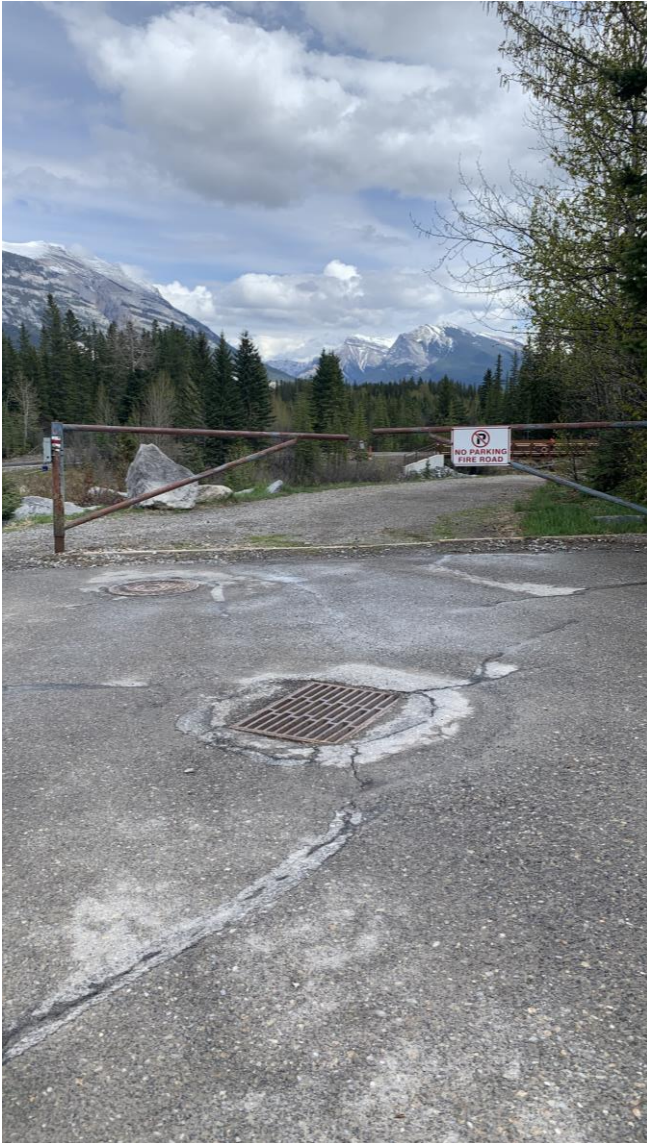
Figure 13: Prospect Heights.