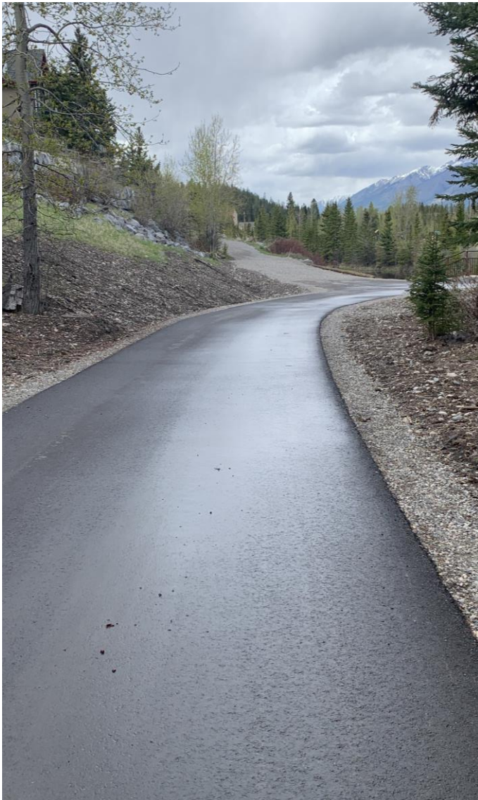
Figure 5: Emergency Access Ln. (left)