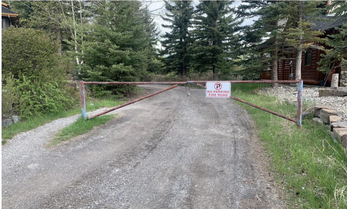
Figure 1: Access to Prospect Ln from Prospect Ct.

Date: May 24, 2024 Project No.: 62216 From: ISL